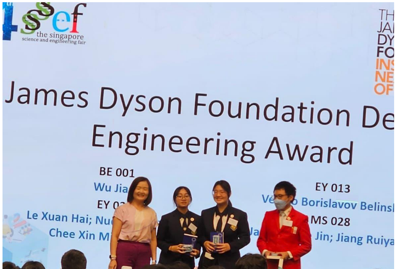
GMS(S) and NJC joint research project won a special award category at the 2024 Singapore Science and Engineering Fair (SSEF).