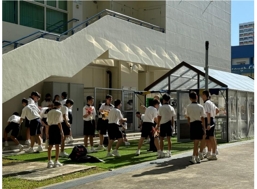
Sec 2 students enjoying their harvest.