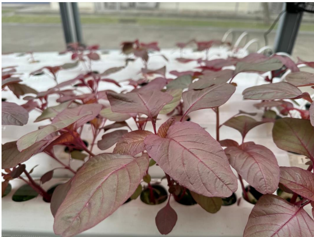
Red Bayam grown in the Nutrient Film Thin (NFT) hydroponics at the school's greenhouse.